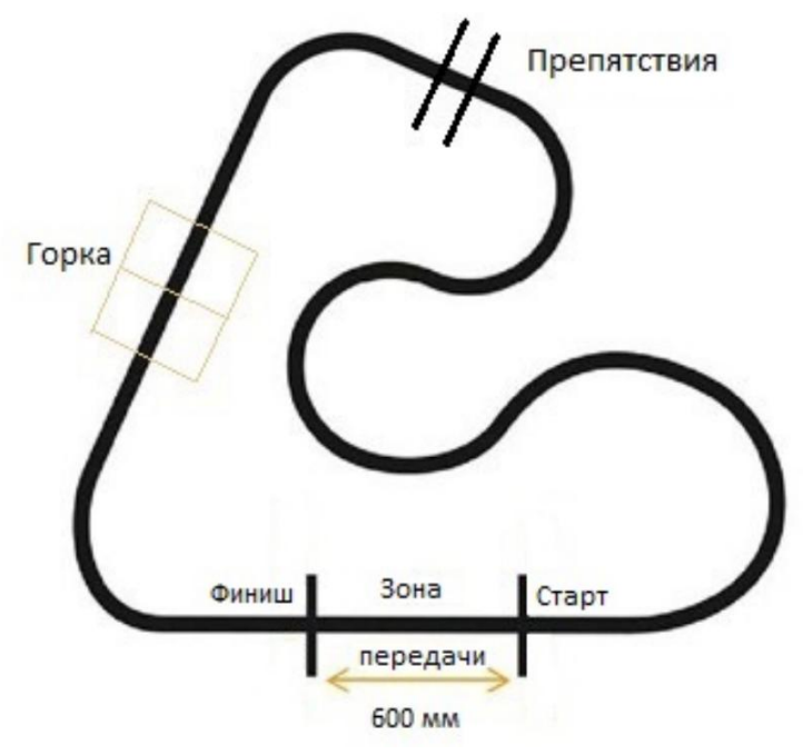
Fig. 1. Field sample